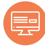
UI & FORMS